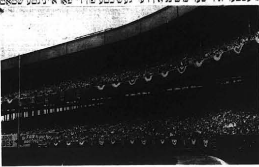
בילדער פון דעם היסטארישן מיטינג אין פאלא גראונדס