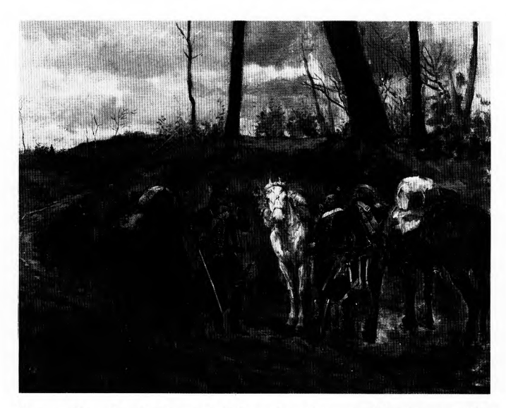
Fig. 2 Jean-Louis-Ernest Meissonier, Outpost of the Hussars (first study for full composition), 1868, oil on panel, 11^{1/2} " × 14" (29 × 36 cm), private collection.