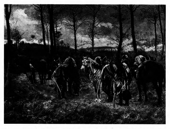
Fig. 1 Jean-Louis-Ernest Meissonier, Outpost of the Hussars (Petit poste de grand' garde), 1869, oil on panel, 10½" × 14¾" (26 × 37.5 cm), Tarbes, Musée International des Hussards.