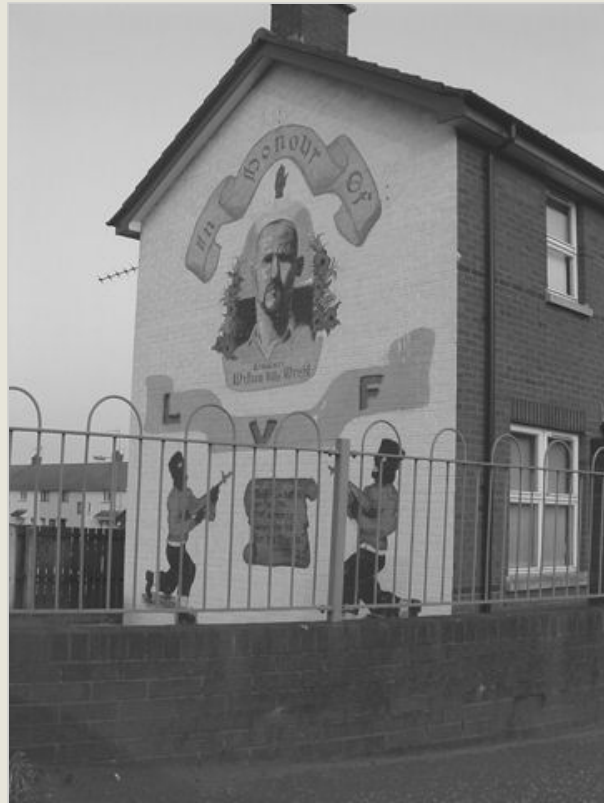
Figure 1.1 A mural honoring Billy Wright, a founder of the Loyalist Volunteer Force (LVF), photographed June 29, 2005.

could only be read by people who entered the garden and walked to its back corners. The arrangement of the garden diminishes the prominence of the kinds of violent images and references that had dominated the original Billy Wright mural nearby. However, according to Gareth, the design of the mural and garden projects involved a difficult, months-long process of consultations, and while the removal of the Wright mural brought tears of grief to some eyes during the unveiling, others expressed (p.5)