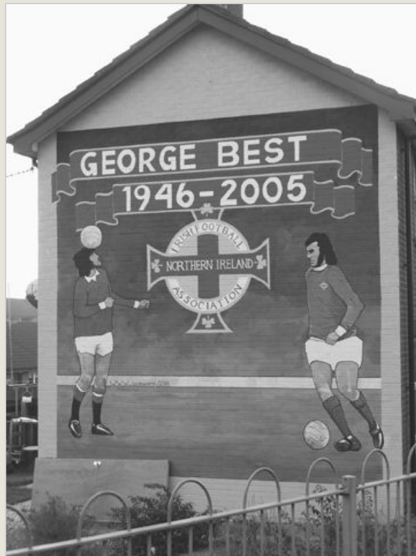
Figure 1.2 A mural honoring Billy Wright was replaced with a mural celebrating George Best. Brownstown Road, Portadown, photographed January 20, 2007.

Such shifts in the symbolic landscape lead us to inquire about concomitant changes in the social psychological landscape of a region where ethno-political conflict has been perpetuated by both violence and prejudices. If the downward spiral of fear and retaliation that characterized thirty years of paramilitary and military violence accompanied a proliferation of antagonistic symbols and (p.6)