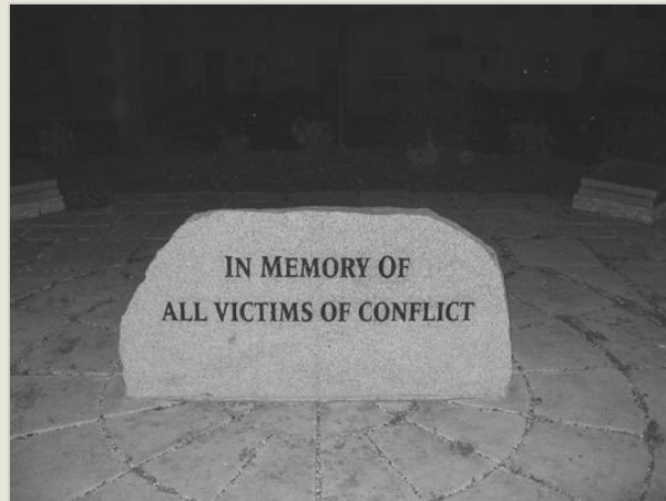
Figure 1.3 Granite monuments to "all victims of conflict". Brownstown Road, Portadown, photographed January 20, 2007.

This is not a post-conflict process but rather a continuation of conflict by other means. Conflict in Northern Ireland has long been contested by many means: political, economic, cultural, and military. The central story of the peace process has been a long shift away from violent and coercive methods toward persuasive and political ones, and we might do well to adopt Brewer's (2010) nomenclature of "post-violent society" while acknowledging (as Brewer does) that political and