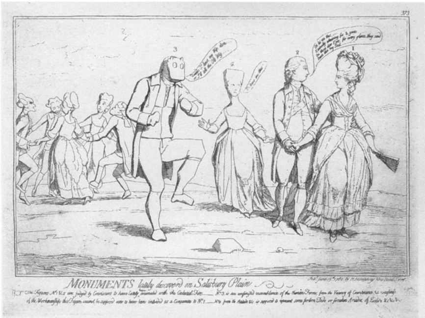
James Gillray. Monuments Lately Discovered on Salisbury Plain.

chase of some months, captured the Perdita frigate, and brought her safe into Egham port. The Perdita is a prodigious fine clean-bottomed vessel, and had taken many prizes during her cruise, particularly the Florizel , a most valuable ship belonging to the Crown, but which was immediately released, after taking out the cargo. The Perdita , was captured by the Fox , but was afterwards retaken by the Malden , and had a sumptuous suit of new rigging, when she fell in with the Tarleton . Her manoeuvring to escape was admirable; but the Tarleton , fully determined to take her or perish, would not give up the chase; and at length, coming alongside the Perdita , fully determined to board her, sword in hand, she surrendered at discretion. 27