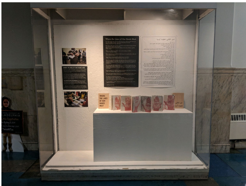
Figure 1. Where the Lines of Our Hands Meet on display at City Hall in Philadelphia in 2019.

that contained harmful language, such as xenophobia, cultural stereotypes, and language that articulated unwelcomeness. The scraps were then pulped and repurposed into new paper that would be formed into the final accordion book. Once dried and cut, images of collaborators' hands were superimposed on the paper, and a collaboratively written poem was printed on the paper and later hand-calligraphed, in Arabic, by project collaborator Abdul Karim Awad. When unfolded, the hands appear side-by-side, and the book extends beyond the length at which just one person could hold the book. When folded, the hands meet palm to palm (Figure 1). Where the Lines of Our Hands Meet is an invitation to contemplate our human connection, but in its process, it also points to the ways in which disconnection and misunderstanding can be overcome through collaborative making.