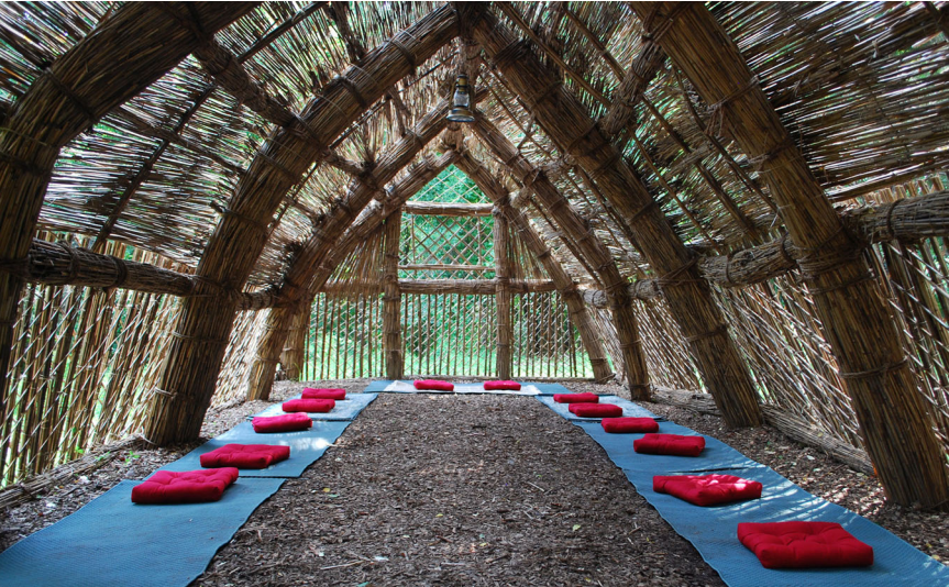
Figure 4. The inside of Al-mudhif , which was made entirely by hand by community members.

is when an artwork can contribute most to peace-building (Figure 4). The process of building Al-mudhif is as important to an understanding of the work as the structure itself. The project allowed for participants to truly become part of the work, as much physically as emotionally. Some art