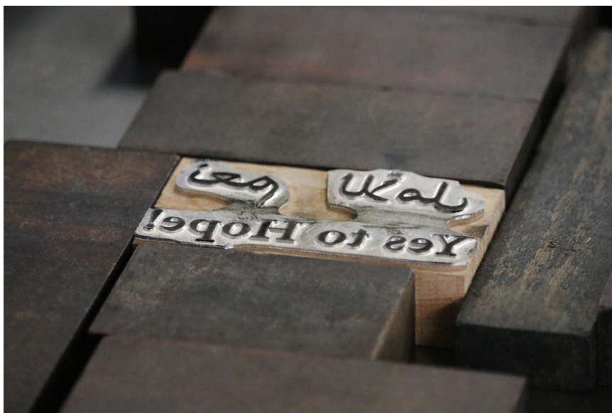
Figure 2. Custom letterpress plate used to print the title on covers of Yes to Hope! (2018).

by founding a new Arabic newspaper in Philadelphia to be a forum for the Arabic community and engage with people who want to learn more about the Arabic language, culture, and food — everything related to our community in Philadelphia. 4 Collaborators chose to retain the project name for the newspaper, and the first issue of the Friends, Peace, and Sanctuary Journal came out in May 2020.