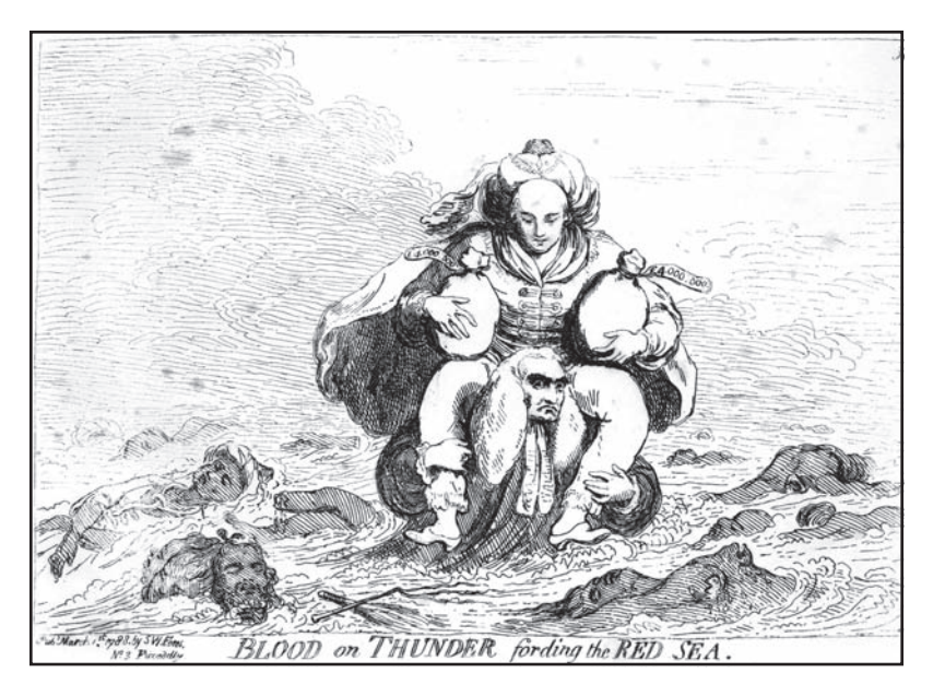
Figure 1. James Gillray, Blood on Thunder fording the Red Sea (1788). This item reproduced by permission of The British Museum (BM Sat 7278).

those circumstances where the sympathies of nature are awakened, where the remembrances of our infancy and all our tender remembrances are combined, they put the nipples of the women into the sharp edges of split bamboos and tore them from their bodies" (W, 6:421). Burke's list of Rangpurian tortures consistently translates specific modes of violence into universal crimes against nature, but this sentence marks the breakdown of that method. Its two halves remain incommensurate—the violence excruciatingly concrete and vivid, the introductory claim an odd mixture of indirection (nature violated "where the sympathies of nature are awakened"), generalization (the double appeal to nature), and possessiveness ("our infancy," "our tender remembrances"). In this sentence, Burke's rhetoric tears the violence from its context, presenting these mutilated breasts as bound up in the tender remembrance of "our" infancy. Even as he seems to take for granted the equality of British and Rangpurian mothers, in other words, Burke's argument assumes the British colonization of the female body as a matter of "nature." The trial of Hastings merely raised the question of how the resources of this female body were to be husbanded by the sons of England: Burke's