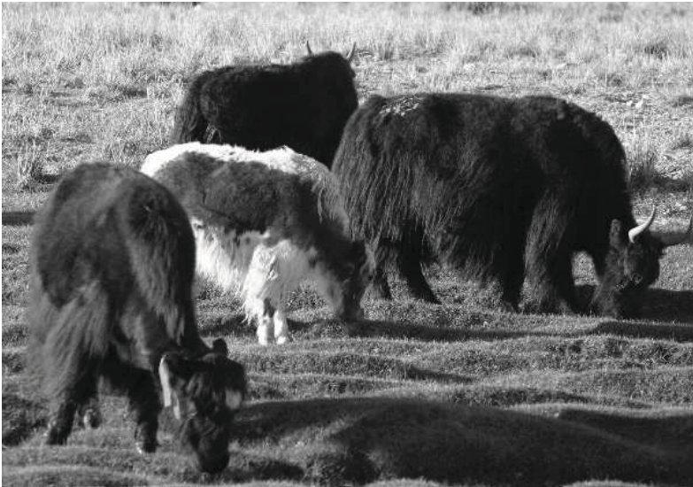
Fig. 4 Domesticated yaks in western Mongolia, 2004. The yak in the foreground cannot be considered ‘black’ because it has a small white head-spot. The yak on the right is black.

Tuvans thus employ a set of ‘emic’ categories that parse the visual color / pattern palette of animals, as culturally defined, into the lexicon. Blue, for example, is culturally more salient than black for Tuvans, and is learned earlier and used far more frequently, perhaps in part because it is a rare and prized yak and goat color. In the Berlin and Kay (1969, Kay 1975) hierarchy, black comes before blue in the order in which languages augment their color term repertoire. For Tuvan children, blue comes first. While it is beyond the scope of this paper to review the entire color perception literature, field linguists can profit from careful attention to the uses of color terms in their native environment while suspending any expectations of universality (Levinson 2000).