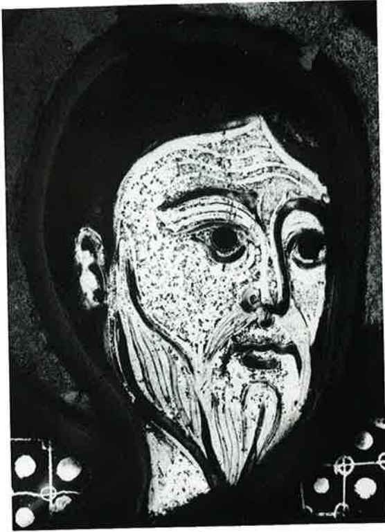
FIG. 4. Head of an apostle. Le Champ-près-Froges, Church of Notre-Dame.