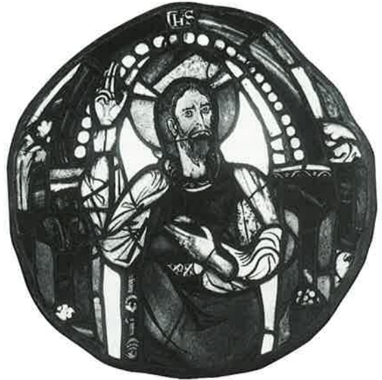
FIG. 2. The "Tête Gérente" within the "panneau d'antiquaire" in which it entered the Musée Ariana in 1885.