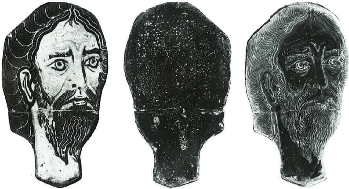
FIG. 3. The “Tête Gérente” as it appears today in the Musée d’Art et d’Histoire, Geneva: (a) interior view with transmitted light, (b) exterior view with surface light, and (c) interior view with surface light.

nom qui vient non moins naturellement à l’esprit, à cause de l’‘énergie’ du style”). He saw no close stylistic relationship with extant glass from either place.