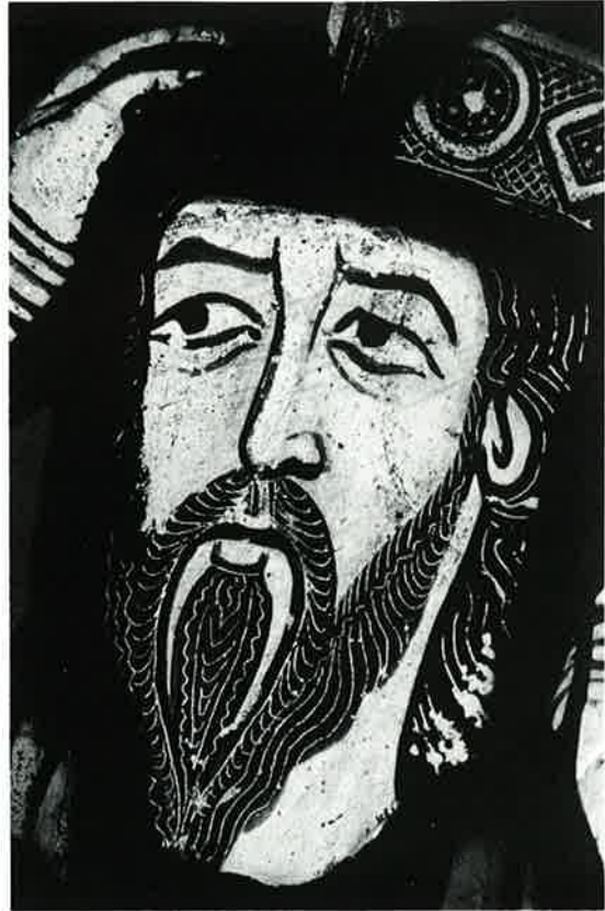
FIG. 6. Head of a sleepy Magus . Detail of Fig. 5.

The head of one Magus (Fig. 6) is particularly close to the “Tête Gérente.” There is, admittedly, a distinction in expressive effect—the sleepy attitude of the awakening Magus contrasts with the alert concern expressed by the “Tête Gérente.” But the linear systems used to define noses, eyes, and lips are quite closely related, and these are the facial features this artist chose to standardize from head to head. Although the two faces display different sorts of ears and beards, both types in the “Tête Gérente” can be documented in other heads painted by the Jeremiah Master, 15 who seems to have delighted in the use of a variety of formulas for these facial features throughout his work. The stylistic relationship between these two heads is heightened by the use of the same very distinctive stick-lighting technique to detail the beards and hair. 16 A variety of linear marks—straight slashes, undulating curves, zigzags, and V 's—are employed