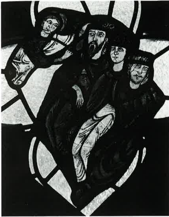
FIG. 5. The Dream of the Magi , panel from the Infancy of Christ window of the Abbey Church of Saint-Denis. Now in the collection of Lord Barnard, Raby Castle.